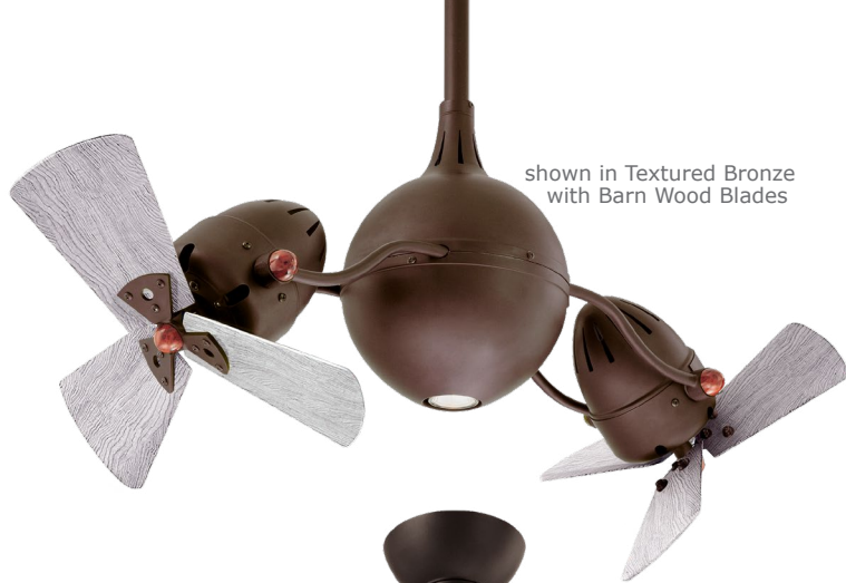
shown in Textured Bronze with Barn Wood Blades