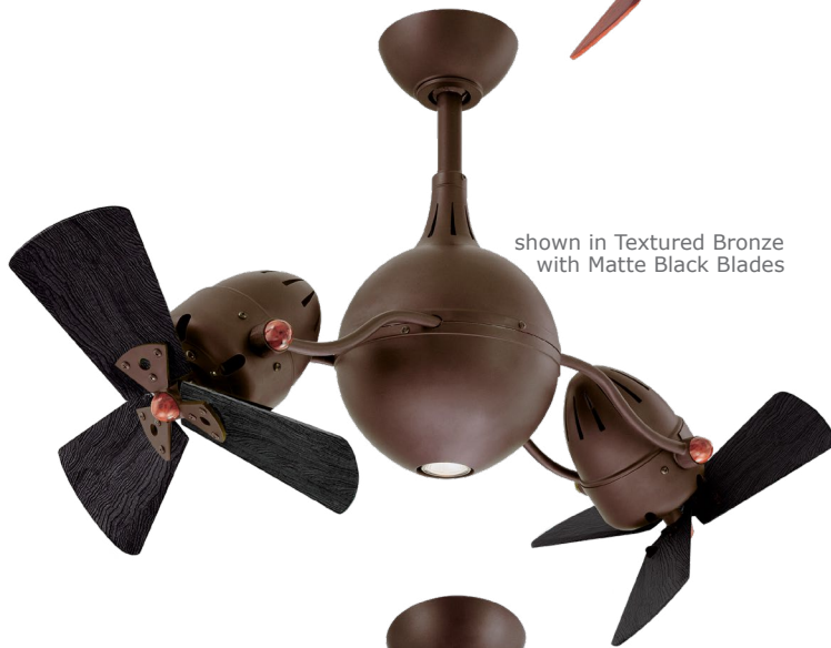
shown in Textured Bronze with Matte Black Blades