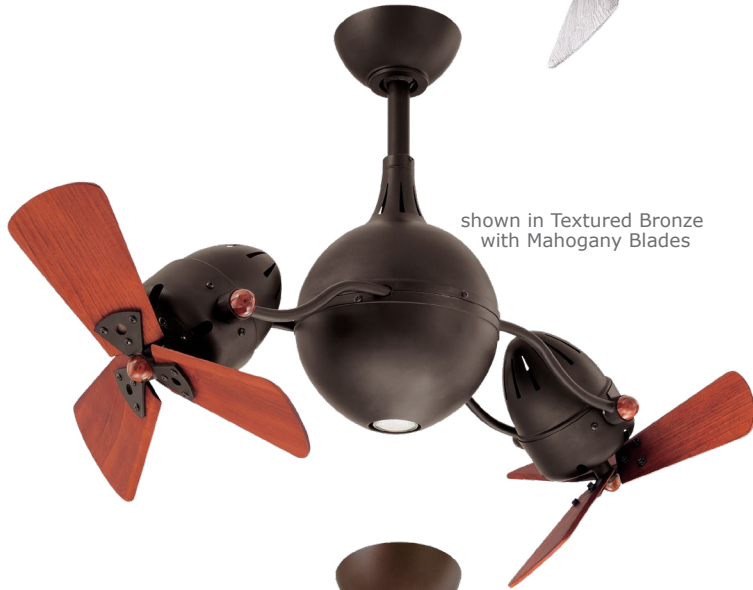
shown in Textured Bronze with Mahogany Blades