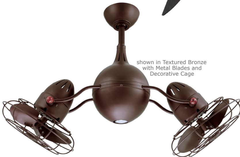
shown in Textured Bronze with Metal Blades and Decorative Cage