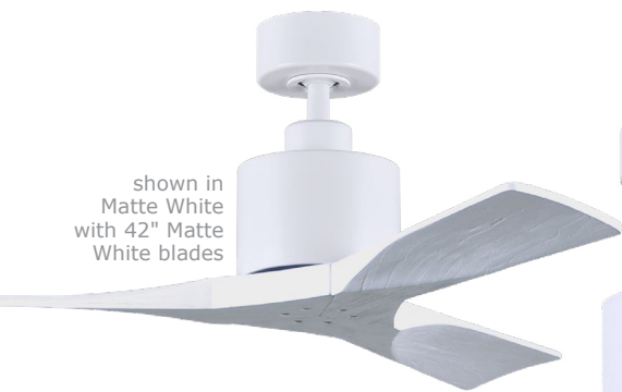
shown in Matte White with 42" Matte White blades