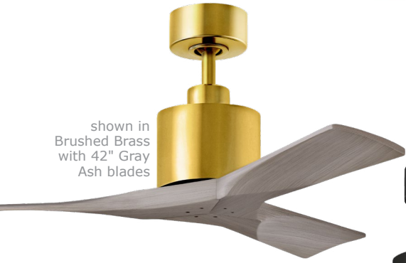
shown in Brushed Brass with 42" Gray Ash blades