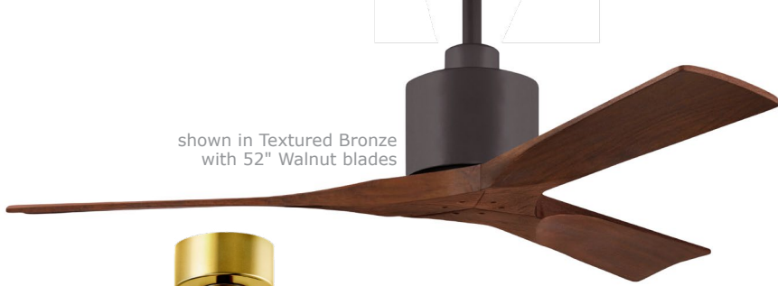
shown in Textured Bronze with 52" Walnut blades