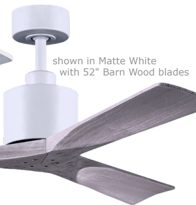
shown in Matte White with 52" Barn Wood blades