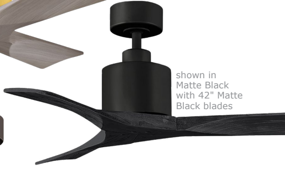
shown in Matte Black with 42" Matte Black blades