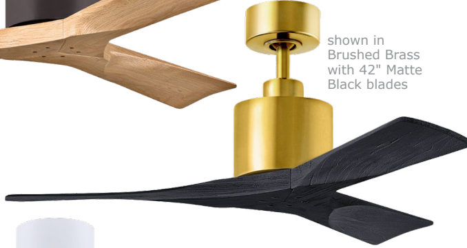
shown in Brushed Brass with 42" Matte Black blades