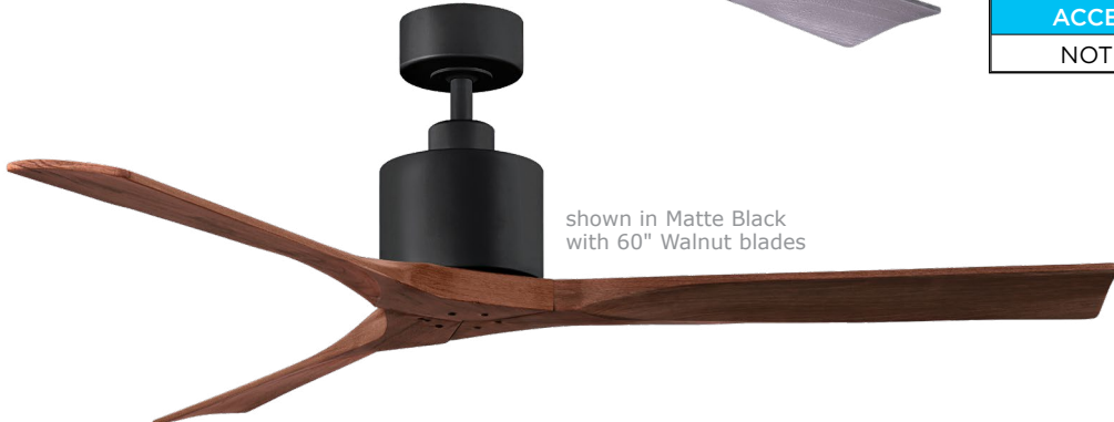
shown in Matte Black with 60" Walnut blades