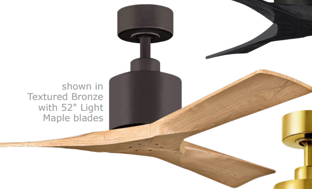
shown in Textured Bronze with 52" Light Maple blades